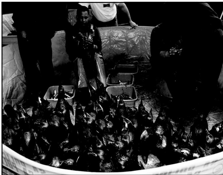
© AP Photo/Obed Zilwa. Used by permission.

penguins' primary habitat. In a matter of days, thick, toxic liquid had covered about 20,000 penguins. Without swift help, the seabirds would have no chance for survival.