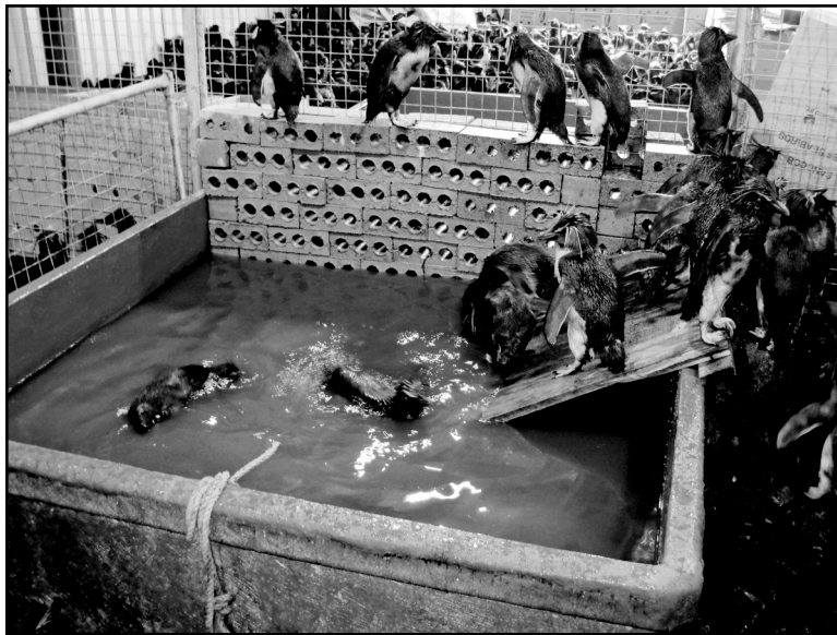
Tina Glass Tristan da Cunha Photo Portfolio www.tristandc.com